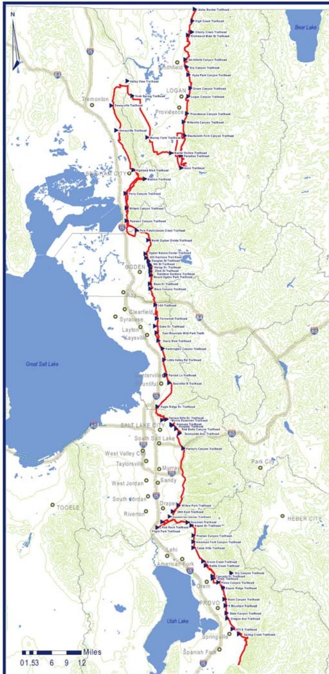
BONNEVILLE SHORELINE TRAIL